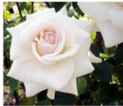
Rose Latin name? _____