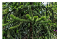
Monkey Puzzle Tree What's the latin name?