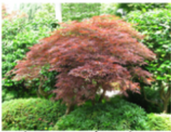
Acer palmatum What is the common name? How many different Acers can you find?