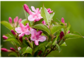
Weigela (Can you find a common name for one?)

Remember to leave no trace - do not pick any plants and wash your hands after touching anything!