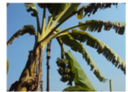
Banana Tree Where does tree this come from?