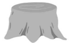
A fossil What was this plant called? Was it a tree?