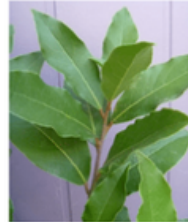
Laurus nobilis What could this plant be used for?