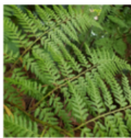
Ferns What is the latin name for this plant?