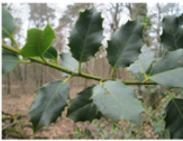
Ilex aquifolium Can you think of a song about this plant?