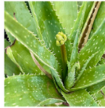
Aloe Vera Where is this from?