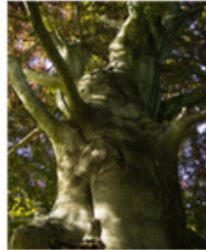
Copper Beech What is its Latin name?