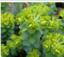
Euphorbia Can you find one that smells like honey?