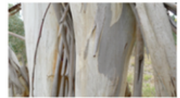
Eucalyptus pauciflora What is the common name?