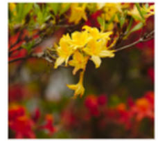
Rhododendron What is this plant family called? How many can you see?