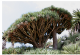
Dracaena draco What mythical beast is this named after?